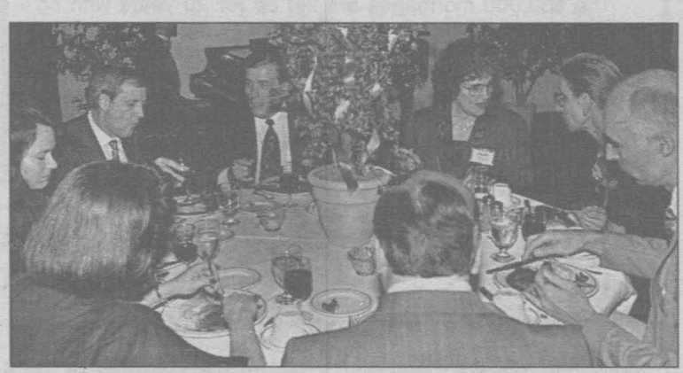
REUNION-Alumni and faculty share a Homecoming dinner on the college campus.